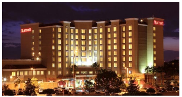
Homecoming Dance 2019 Marriott 12600 Roosevelt Blvd. St. Petersburg